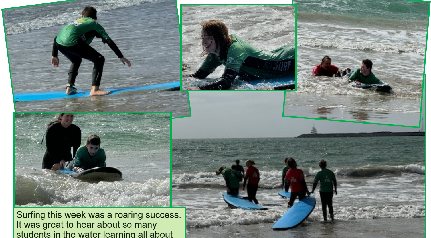
Surfing this week was a roaring success. It was great to hear about so many students in the water learning all about ocean-based water safety and having the confidence to get up on a surfboard.