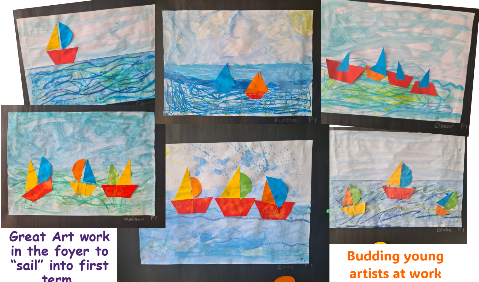
Great Art work in the foyer to "sail" into first term.